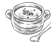
Soups and stews